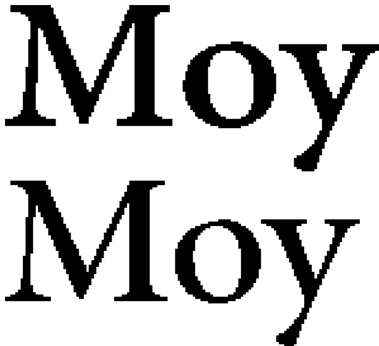
Figure 6: Minion instances from opposite ends of the optical size axis set at the same size (exaggerated)